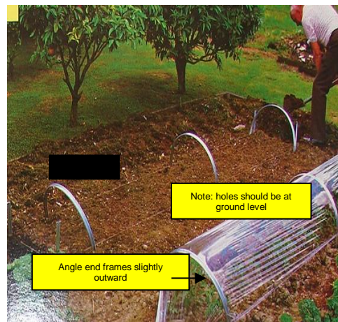
Push the frames into the ground. Dig 150mm deep holes at each end of the bed