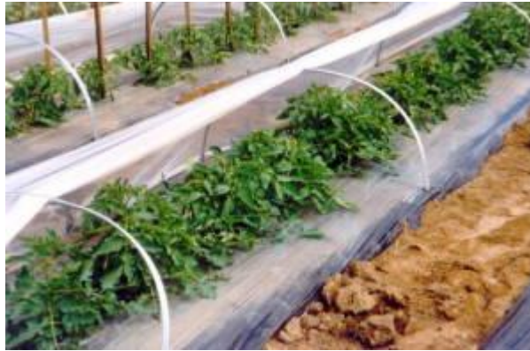
Cloche over mulch film

Plastic film is not supplied with cloche frames unless stated