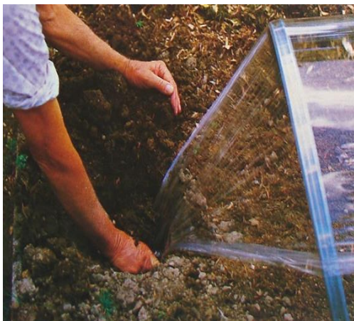
Bury the second end →