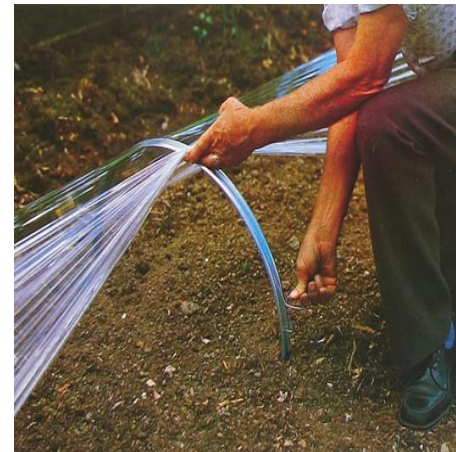
Exclusive adjustable clips ensure that the cover stays where you want it. →