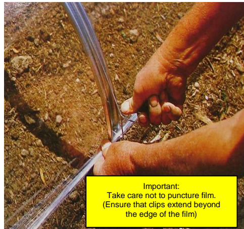
Secure the cover in place by locating the wire clips into the frame holes. →